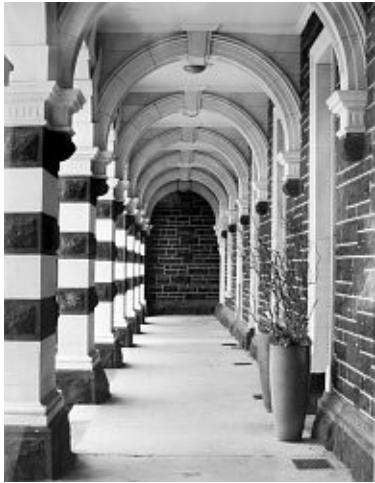
Fritz Grupe Train Station, Dunedin, New Zealand