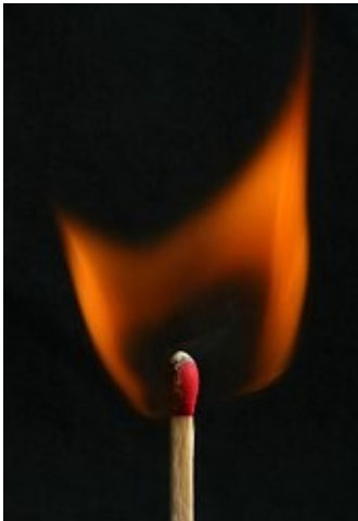
Jeff Lawrence Match Light 2