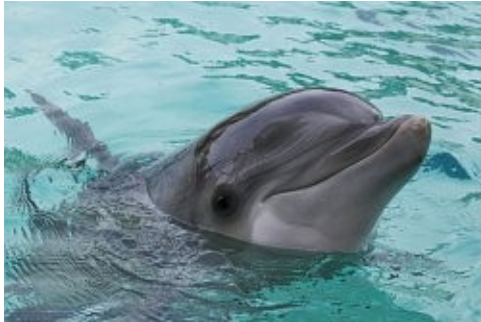
Karen Devine Dolphin 1