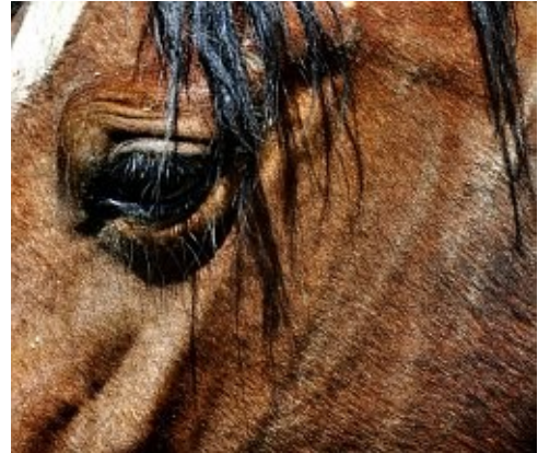
Val Dutter Eye Of A Mustang