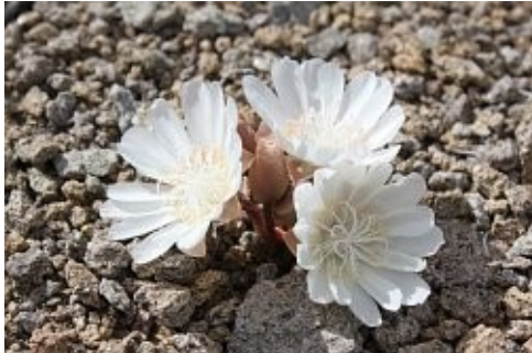
Greg Cotterman Bitterroot