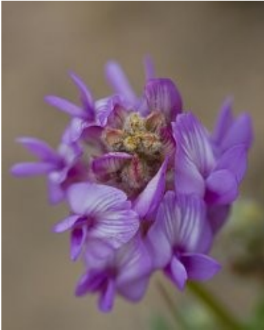
Emily Ross Wildflower 1