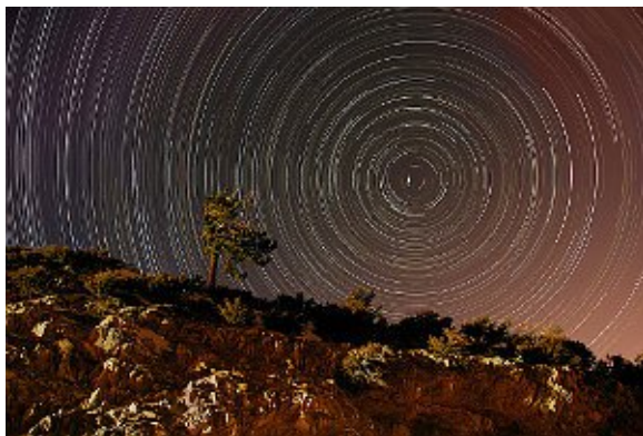
Windswept Tree on Slide Mountain