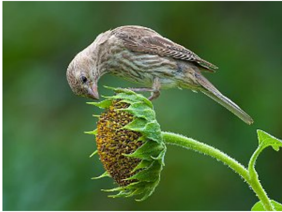
House Finch Feeding on Sunflower